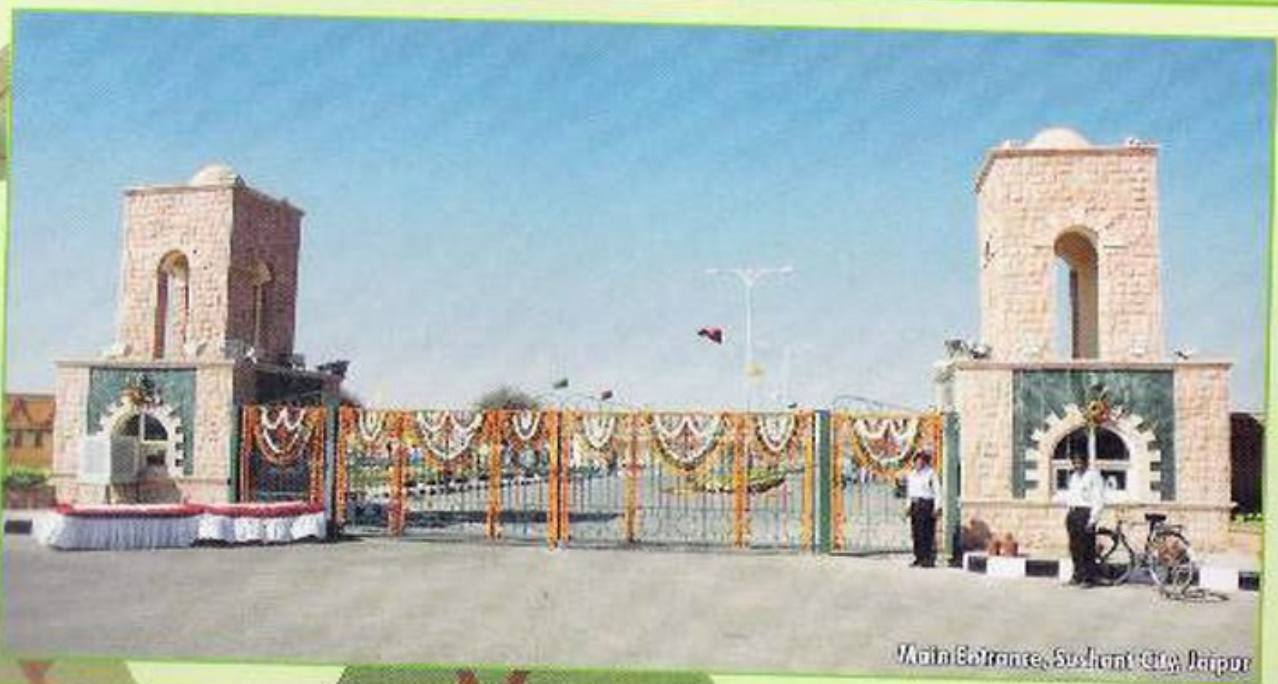
Main Entrance, Sushant City Jaipur

A TPL now bestows a captivating opportunity for the people of Jaipur to enjoy the lavishness and class that is identical to a metropolitan lifestyle. Ansal in collaboration with Neha Leasing & Holding Ltd, brings you the township of lush greenery where you can discover the true ecstatic meaning of living together. Anand Lok is yet another landmark in the Real Estate development with a difference of personal flavour. Located ahead of Sushant City-I & II, it is spread over the wide green area of 70 bighas (approx) and offers you a chance to whirl your impulses in the greenland of Anand Lok.