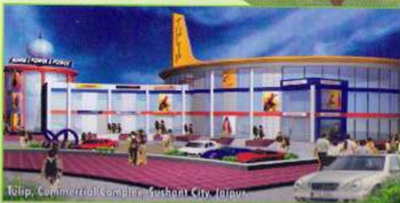
Tulip, Commercial Complex, Sushant City, Jaipur

Here life is supported in all its forms with the requisite infrastructure. Spaces that are valued and trendy as an originator of modern home where grin blossoms, in alliance with mother nature. One can find life here in complete harmony. The township has pollution free, elite and eminent living edifices as well as infrastructure support for conventional and alternative care facilities. Anand Lok offers you a superb living experience in a splendid location.